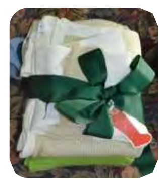
Warm Wishes from Women Helping Women!