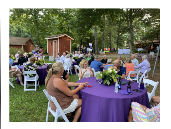
Steps to HOPE's Spring Shindig (shown above and below) was a hit! Everyone enjoyed a night of dining, dancing and donating to kick-off our Capital Campaign.