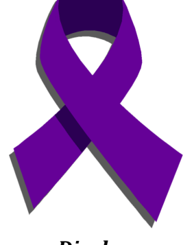
Display a Purple Ribbon to PROMOTE AWARENESS

The purple ribbon began as a small visual gesture of support for survivors and victims of domestic violence and is now one of the most widely recognized symbols of the movement against domestic violence.