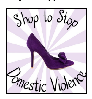
To arrange for pick-up, please call