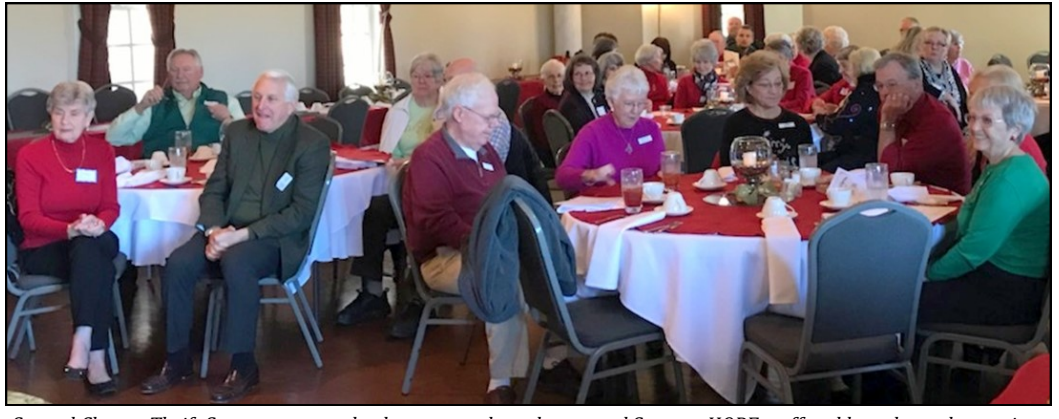
Second Chance Thrift Store year-round volunteers and employees and Steps to HOPE staff and board members enjoy a delicious brunch at Green River Plantation in Rutherfordton, NC to celebrate the holidays

Many thanks go out to Parsec Financial for their generous sponsorship this year.